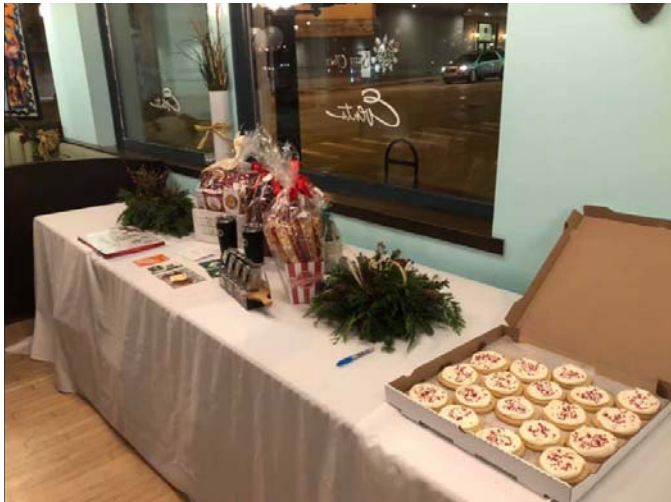
Thanks again to our raffle donors!