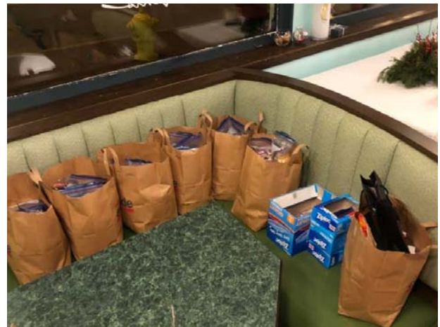
Over 200lbs of food assembled!