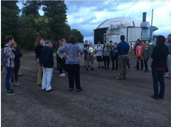
Touring at the Research & Education Center in full-swing!