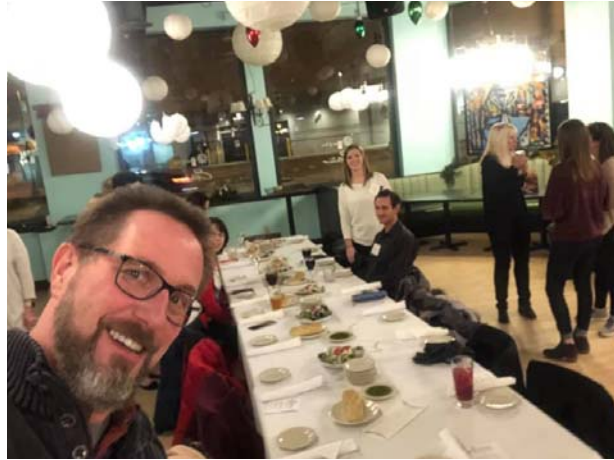
Enjoying the holiday cheer at San Chez, and hearing about GLIFT Section Updates!