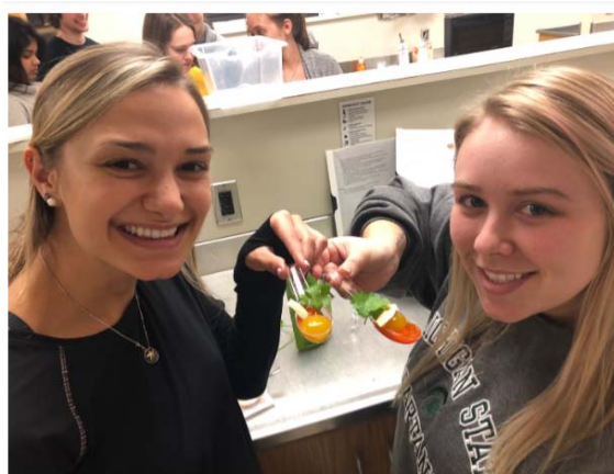
Molecular gastronomy night: