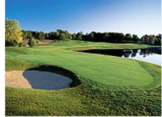
Yarrow's 5th hole features a variety of hardwoods, wetlands, and the winding Augusta Creek.

Students - If you are interested in volunteering to help out at suppliers day – Contact Sue Riippa [sriippa@hwingredients.com]