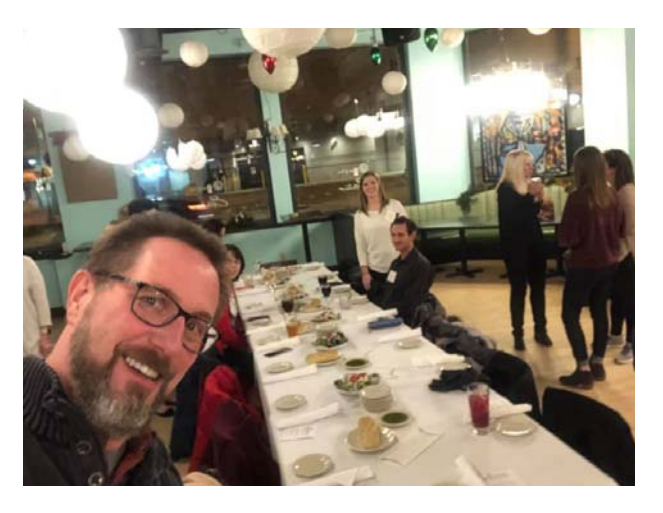
Enjoying the holiday cheer at San Chez, and hearing about GLIFT Section Updates!