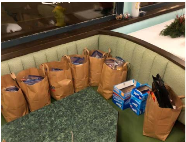
Over 200lbs of food assembled!