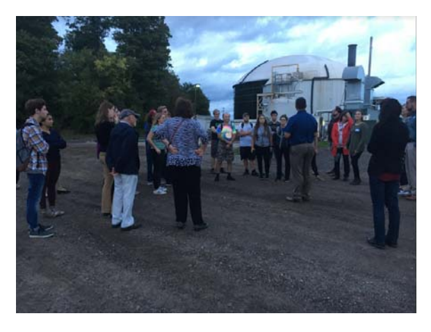
Touring at the Research & Education Center in full-swing!