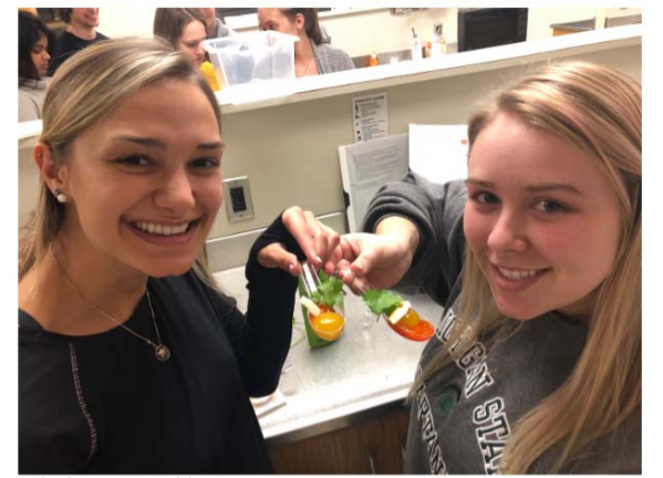
Molecular gastronomy night: